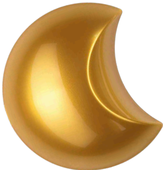
LIFOCOLOR-BRILLANT GOLD M1N02-40 PE (Art. 15348)