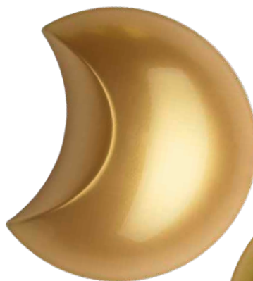
LIFOCOLOR-BRILLANT GOLD M1N03-40 PE (Art. 15355)