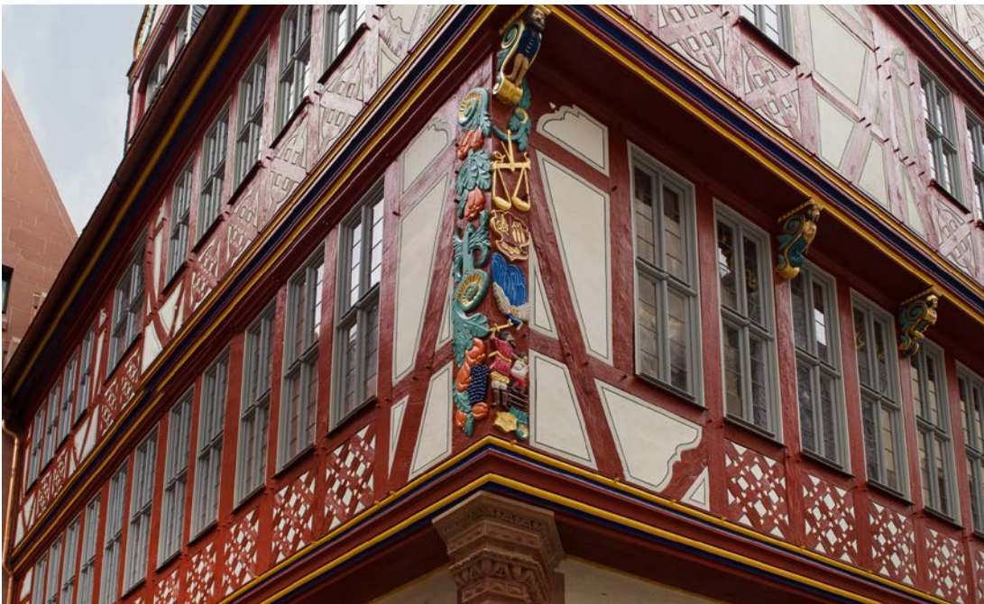
“Goldene Waage” building, Frankfurt am Main, Germany

SCHOTT's Glasses for Restoration are the best choice for the faithful restoration of historical buildings from various eras – mimicking the appearance of the original glazing materials – GOETHEGLAS for buildings from the 18th and 19th centuries, RESTOVER® glass for buildings dating from the early 1900s and TIKANA® glass for buildings from the classical modern period – these glasses also meet any number of contemporary needs because of the wide variety of processing options available, from UV protection to thermal insulation.