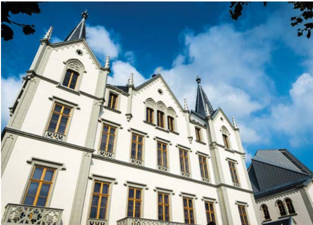
Château de l'Aile, Vevey, Switzerland

GOETHEGLAS is a colorless, drawn glass with the irregular surface characteristic of window glass common to the 18th and 19th centuries. It can also be used to protect precious, leaded glazing from the elements and other adverse environmental conditions.