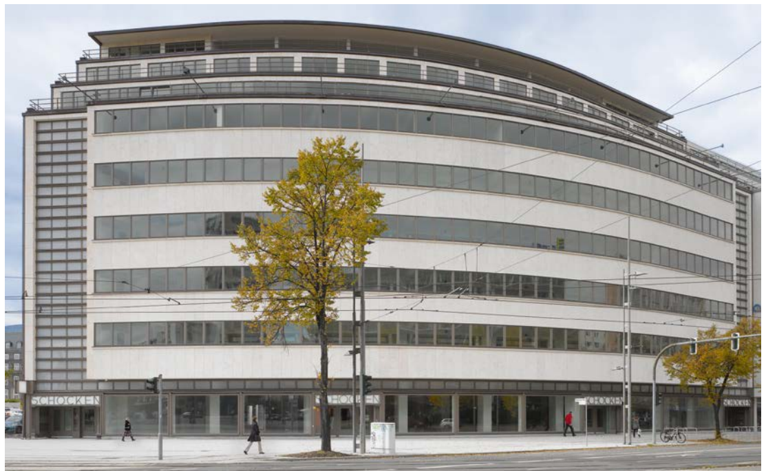
Schocken department store, Chemnitz, Germany