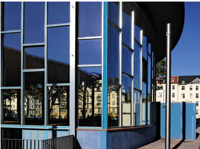
"Palace of Tears", Berlin, Germany

While the surface of RESTOVER® light glass is slightly less irregular, RESTOVER® plus glass has a much more irregular surface structure and resembles mouth-blown glass.