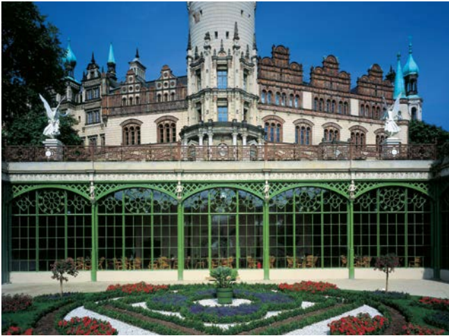
Orangery Schwerin Castle, Schwerin, Germany