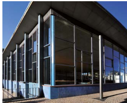
Palace of Tears, Berlin, Germany