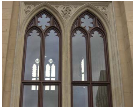
Babelsberg Palace, Babelsberg, Germany