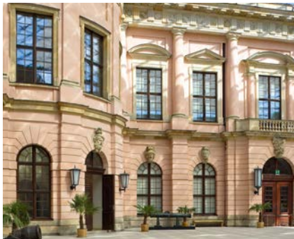
German Historical Museum, Berlin, Germany