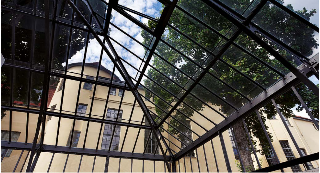
Bauhaus-University Weimar – The Brendel Studio using SCHOTT RESTOVER® laminated glass.