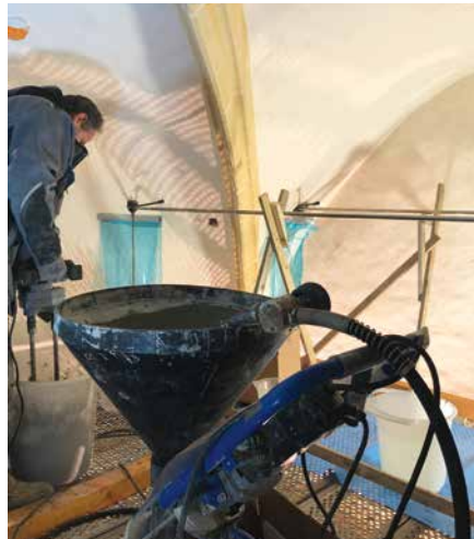
Mixing the DESOI AnchorNox® dry mortar before the anchor rods were injected