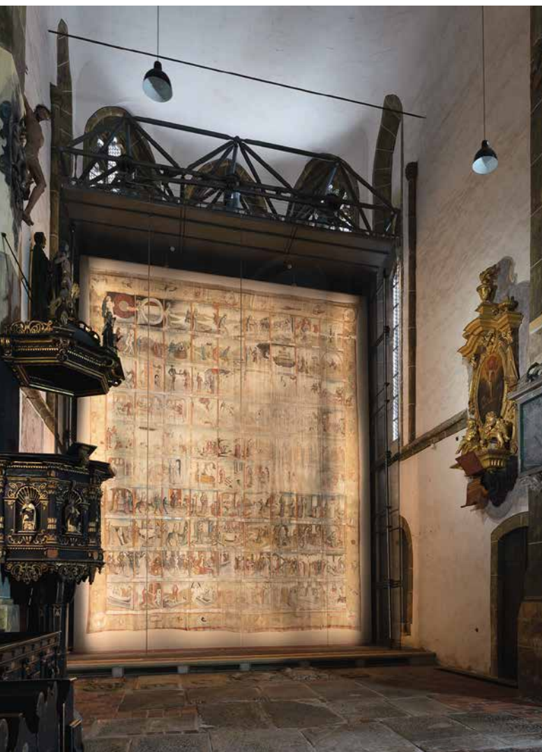
Large Zittau Fasting Cloth

After a fire during the Thirty Years' War, the building, which was being used as a burial church, was restored using late Gothic and early Baroque furnishings. The structure of the church consists of a plastered quarry stone construction with two pillars on the west side and one each on the north and south side, high pointed arch windows and a gable roof, on which a ridge turret with dome and very slender point rest. In 1793, a plaster ceiling was installed in the choir. The sacristy adjoins the choir's north wall. It has a small stair tower on the west side in the corner next to the nave.