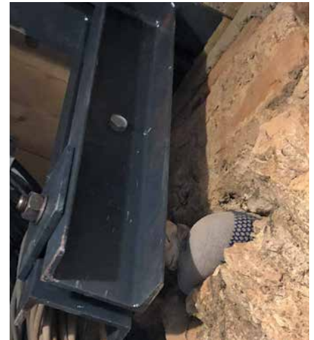
Fully compressed anchor stocking system

Longer anchor rods were adapted on site to the local conditions. Concrete ribbed steel reinforcements and threaded anchors were installed with diameters of 20 – 22 mm. Depending on the anchors' length, a number of spacers were installed. The anchor stocking was sheathed in a woven protective mesh in the area around the spacers to prevent tears while it was being pushed into the borehole.