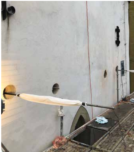
To protect the valuable murals, the stocking anchors could not be installed from within the church's interior.