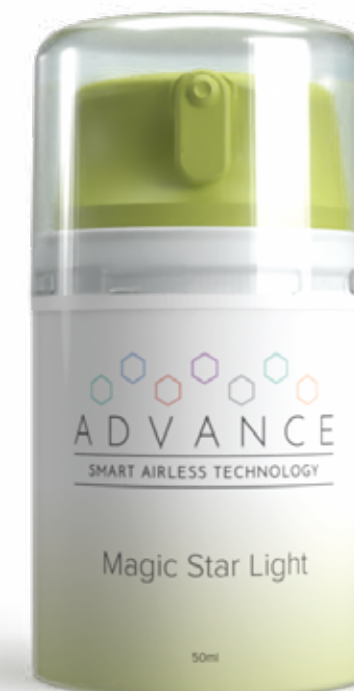
Magic Star Light