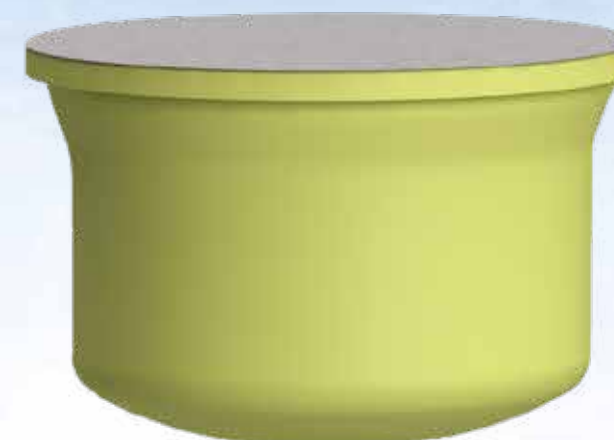
Infinity Quartz Refill