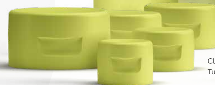
Classic Tube Closures