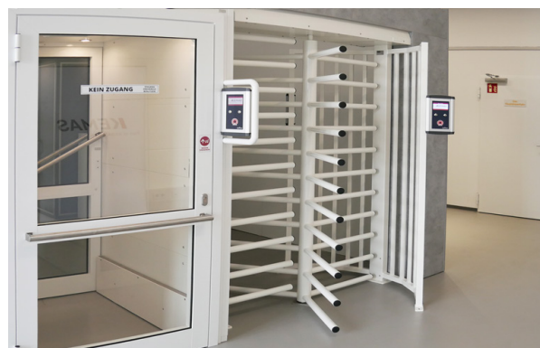
Abb. No. 4 Revolving door standard