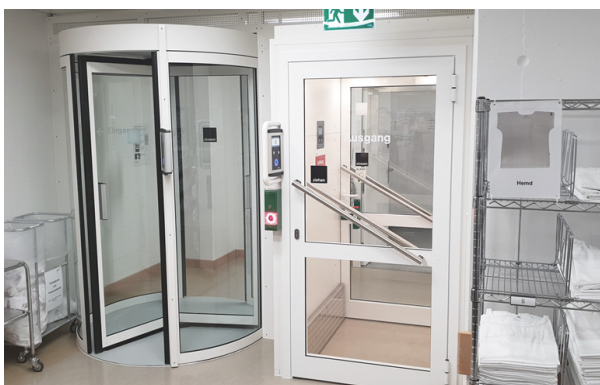
Abb. No. 2 Glas revolving door premium