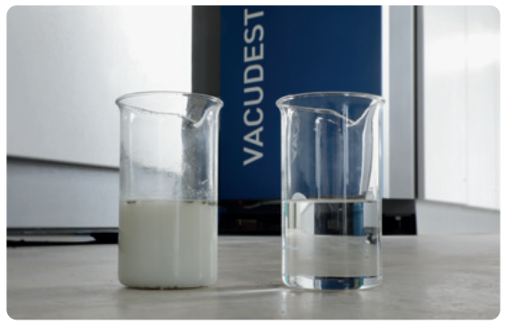
Industrial wastewater is often heavily polluted with oil, fat and heavy metal salts. It is not allowed to be disposed of into the public sewer system without treatment.