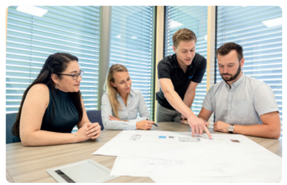
During project development our aim is to optimally integrate the VACUDEST<sup>®</sup> vacuum distillation systems into your production process.