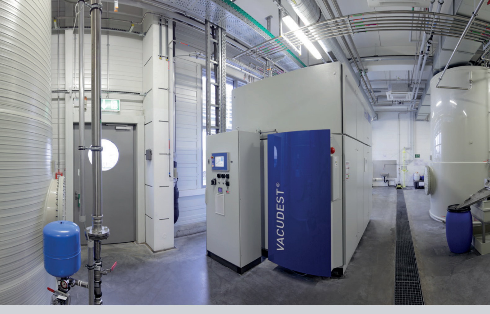
VACUDEST® vacuum distillation systems offer, compared to other treatment systems for industrial wastewater, optimized efficiency and added value. The result is higher reliability and increased sustainability.