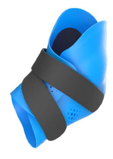
*Also available in a toe walking version or from a 3D scan.